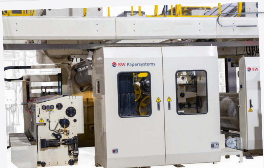
Singlefacer with the glue unit retracted.

The VortX Tornado F3 Starch System was developed to handle higher volumes and increase the flexibility of the system. Modern corrugators use run tanks at the corrugator. This allows thermal control of the adhesive by locally adding chemicals or products on demand and within the confines of the scheduling system. Over 300 Vortx Tornado F3 systems are installed, with customers claiming a ROI of 9 to 18 months.