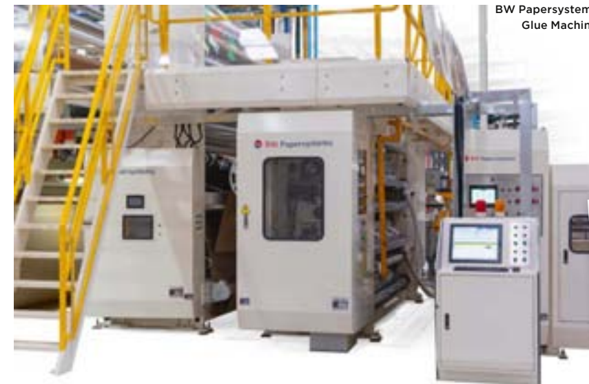
BW Papersystems Glue Machine