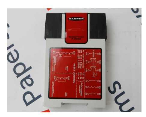
New Safety Relay