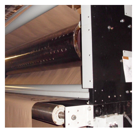
Infusion Plus mounted onto a conventional preheater